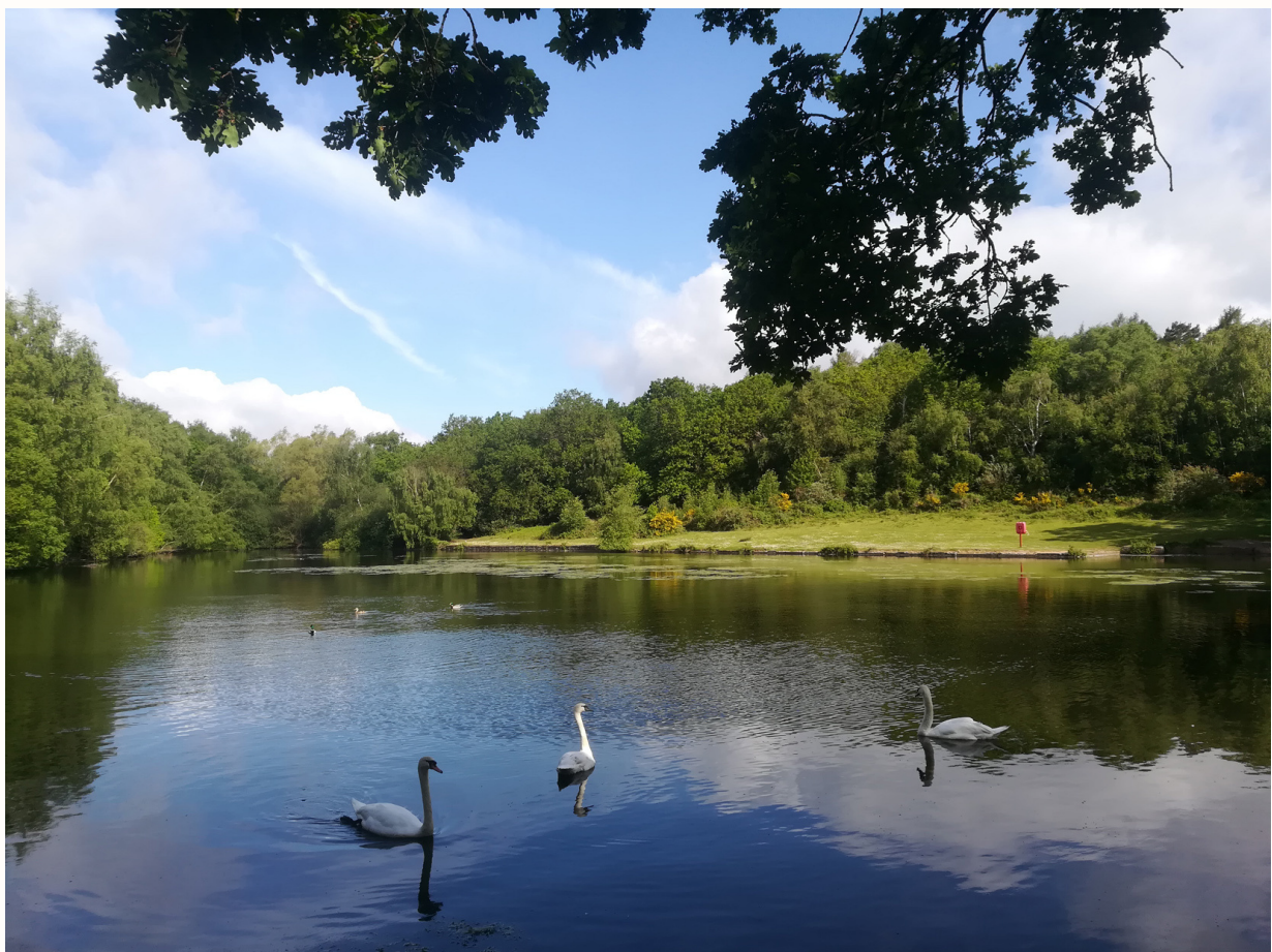
Sutton Park, Sutton Coldfield

Alongside these sessions, we also hosted content online for people to view a summary version of our document. Our work received over 64,000 impressions online, and 67 people completed our online survey on the City of Nature Plan document. A whopping 92% of respondents agreed with our approach, and again, we received a huge amount of feedback that helped us ensure the plan was relevant to the needs and wants of the wider public.